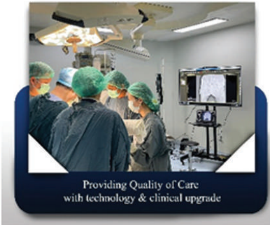
Providing Quality of Care with technology & clinical upgrade