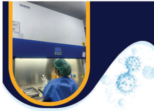
Oncology DayCare Center တွင်အသုံးပြုလျက်ရှိသော Biosafety Cabinet